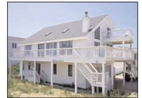
$949,000 3037 Sandfiddler Road Semi-Oceanfront Beach Magic Connie McMahon - Agent