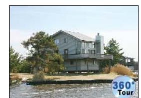
$897,500 3049 Sandbend Road Open Bay View There and Back Again Charlie Kelly - Agent