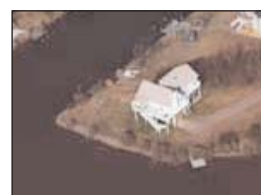
$1,395,000 3237 Little Island Road Open Bay View Jim Kelly - Agent