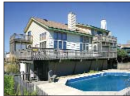
$1,100,000 3688 Sandfiddler Road Oceanfront Dojo Jim Kelly - Agent