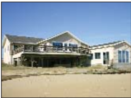
$1,375,000 2740 Sandfiddler Road Oceanfront Angel of the Sea Charlie Kelly - Agent