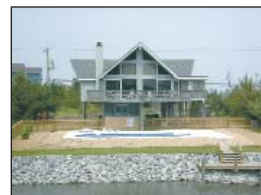
$599,000 2773 Sandpiper Road 4th Row - Canalfront Summer Breeze Charlie Kelly - Agent