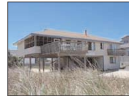
$629,000 3533 Sandfiddler Road Semi-Oceanfront Charlie Kelly - Agent