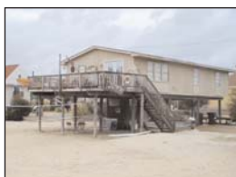
$448,500 3229 Sandpiper Road 4th Row Jim Kelly - Agent