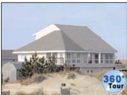
$928,000 3609 Sandfiddler Road Semi-Oceanfront Four the Boys Charlie Kelly - Agent