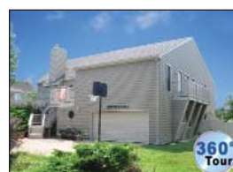
$699,000 309 Sunfish Lane North Side Street Excellent Jim Kelly - Agent