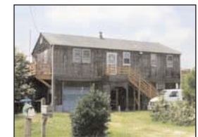
$495,000 2245 Sandpiper Road 4th Row - Canalfront Kathi Davis - Agent