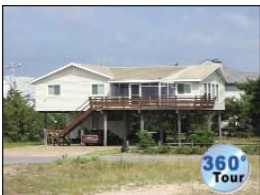
$679,000 3072 Sandpiper Road 3rd Row McClellan/Gemini Charlie Kelly - Agent