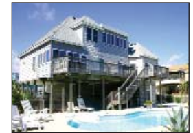
$799,000 3108 Sandpiper Road 3rd Row Ocean Oasis Charlie Kelly - Agent