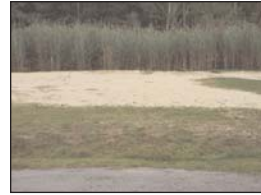
$475,000 313 Tarpon Lane North Side Street Charlie Kelly - Agent

If you are interested in more detailed information on property values, feel free to stop by our office for a visit - we have an agent on duty 7 days a week! Our Sales Team would be delighted to discuss the current market status in Sandbridge and no appointment is necessary. If you would prefer to make an appointment, simply call our Sales Department at 426-6200 or 877-422-2200.