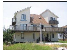
$995,000 3369 Sandfiddler Road Semi-Oceanfront By the Beach Chris Fritts - Agent