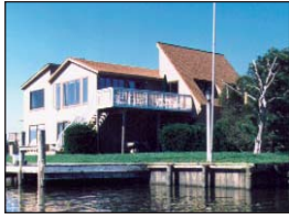
$849,000 349 Pike Circle Open Bay View Halcyon Days Charlie Kelly - Agent