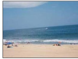
$1,250,000 2552 Sandfiddler Road Oceanfront Chris Fritts - Agent