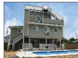
$859,000 2917 Sandpiper Road 4th Row - Canalfront Island Girl Chris Fritts - Agent