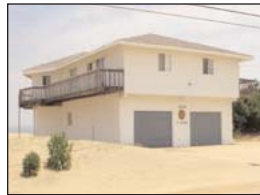
$1,099,000 2948 Sandfiddler Road Oceanfront Charlie Kelly - Agent