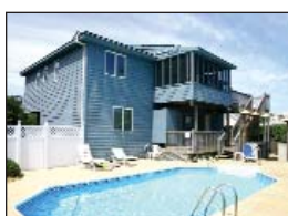
$599,000 305 Swordfish Lane North Side Street Shore to Please Charlie Kelly - Agent