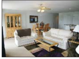
$285,000 #A-201 - Seaside Condos Ocean Getaway Jim Kelly - Agent