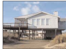
$675,000 3325 Sandfiddler Road Semi-Oceanfront Bev Kwiatkowski - Agent